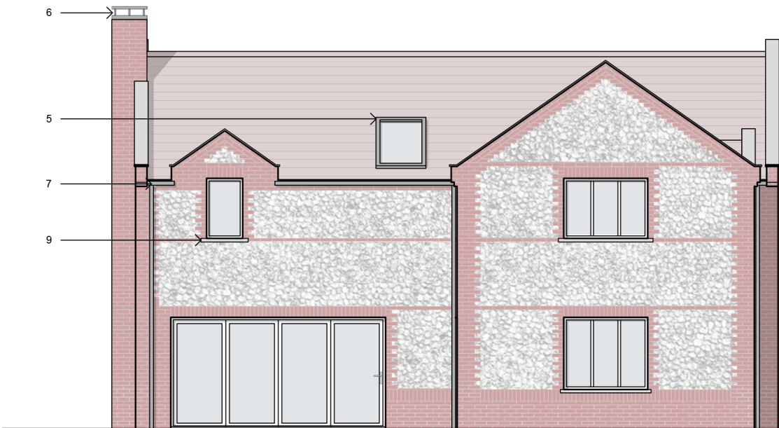
3 REAR ELEVATION