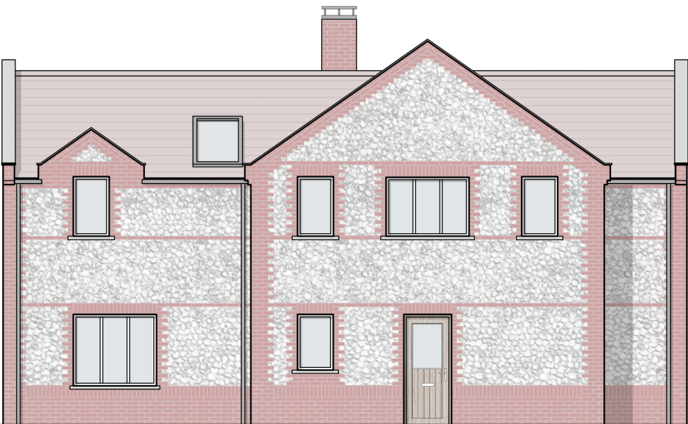
4 SIDE ELEVATION 2

NOTES Do not scale from this drawing electronically or manually, use written dimensions only. All dimensions are in millimeters unless stated otherwise. This drawing is produced for use in this project only and may not be used for another purpose. Pro:works accept no liability for the use of this drawing other than the purpose for which it was intended and is recorded on the title fields 'Purpose for Issue' and 'Drawing Status Code'. This drawing may not be reproduced in any form without prior written agreement of Pro:works. © Crown copyright and database rights 2020. Ordnance Survey Licence Number 0100031673 CDM 2015 The Construction (Design and Management) Regulations 2015 (CDM 2015) makes a distinction between domestic and commercial clients and outlines the duties you, as client, have under Health and Safety Law (HSE). These duties can be found at: http://www.hse.gov.uk/construction/cdm/2015/responsibilities.htm It is your responsibility as client to make yourself aware of your role within CDM 2015 and act accordingly.